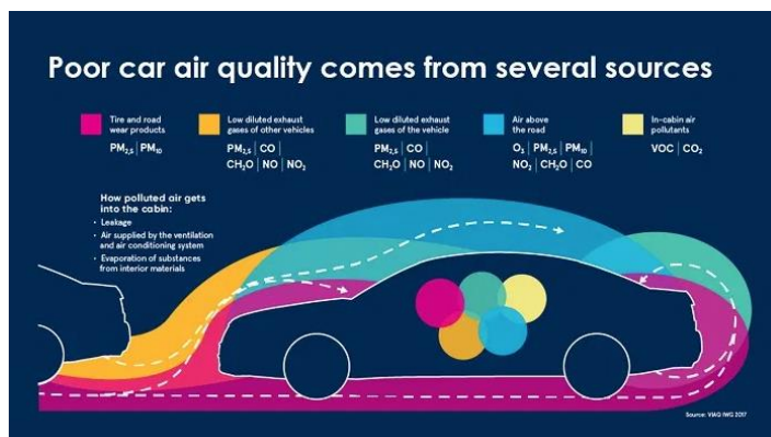
Fig. 1: Several sources of air pollution [9]

Kumar stated causes a higher concentration of pollutants inside the car than in the external environment in their studies. This is due to the fact that emissions from surrounding vehicles penetrate inside cars. The authors present the results of studies that have shown that up to half of the pollutants in the cabs of cars come from vehicles that drive before the name. Vehicles are not airtight and these emissions penetrate through various openings and leaks into the cab [8].