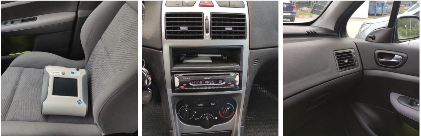
Fig. 2: Several sources of air pollution [9]

setting is the interior cabin is not clean, the service life is 1 month. The second setting is immediately after cleaning the interior of the car.